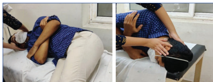
[Table/Fig-2]: Semont's Maneuver.

Semont's maneuver: In this method, the patient was made to sit and the head was turned towards the unaffected side and he/she was made to lie rapidly towards the affected side, with the head turned in upward direction. The patient was maintained in this position for five minutes following which he/she was moved quickly through the sitting position to the lying position on the opposite side with the head facing downward and this position was maintained for 5-10 minutes. After which he/she was brought back to the sitting position slowly [Table/Fig-2].